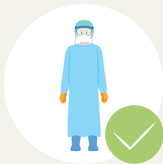
A long-sleeved gown