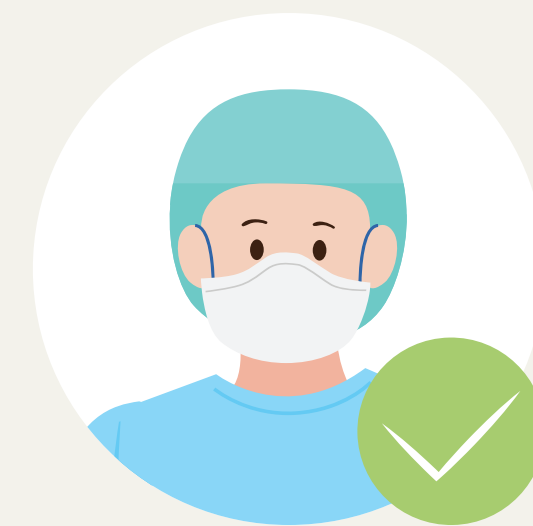
Surgical mask (for all patient interaction) or an N95/P2 mask during other procedures