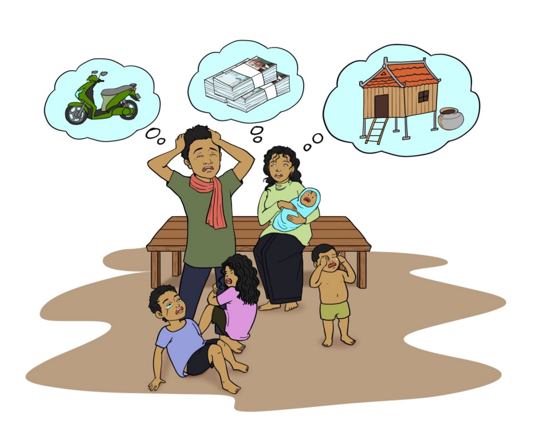
Page 1: So you know how...