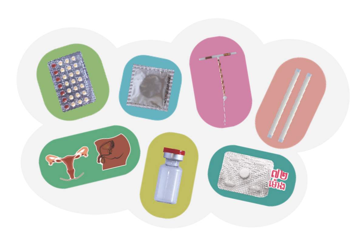
Page 2: Well luckily there's...