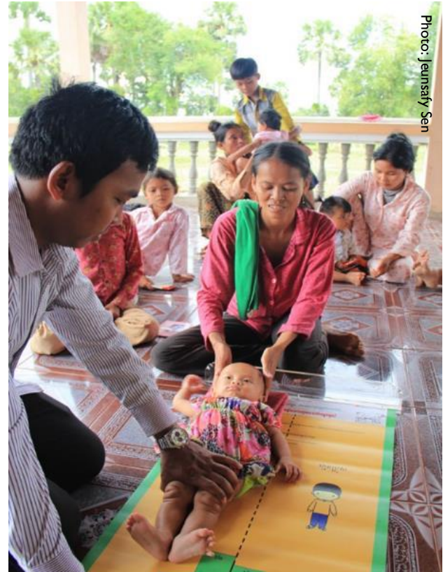
PHOTO 1. COMMUNITY AGENTS TESTING THE LENGTH MAT

Several common challenges around correct use observed during the initial pilot resulted in changes in training and supervision. Observation during the initial pilot revealed an inadvertent tendency of community volunteers to pull children’s toes to reach the green age bar. Community agents wanted to tell caregivers that their child was not stunted so they tried to get the child’s feet over the top line of the bar. As it is a non-clinical tool, community agents are not in a position to diagnose stunting. Therefore, NOURISH worked with community agents and health workers to test appropriate and effective feedback to caregivers whose child does not reach the age bar. They determined that they could encourage caregivers to give ‘extra attention’ to the child who reaches the top of the age bar and to give ‘special attention’ to a child whose heels did not reach the bar at all. Although these phrases are similar, these are meaningful to caregivers. In addition, two people were